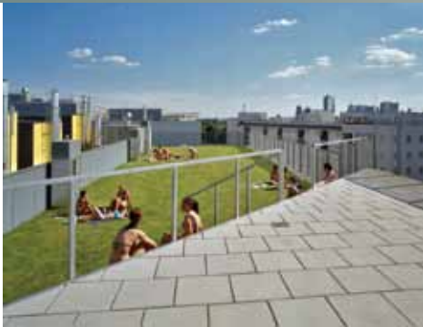
The roof terrace of the Bremer Stadtmusikanten social housing scheme is a collective, semi-public space with a large lawn and a swimming pool.

The sheer amount of public and social housing in Vienna directly influences the private market; it keeps the quality of housing relatively high, and the prices for rent relatively low.