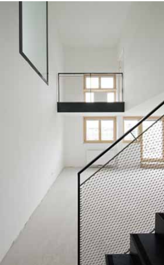
PPAG Architects with the GESIBA housing association, Wohnen am Park, Vienna, 2009 Interior view of one of the 'tetris'-like units in PPAG's Wohnen am Park.