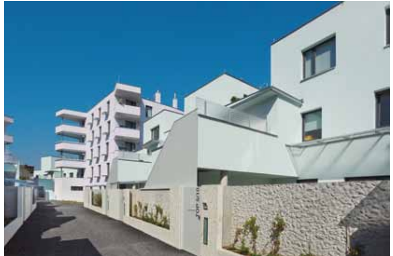
Rüdiger Lainer + Partner with the EBG housing association, Kagraner Spange, Vienna, 2011 bottom: The sophisticated design mixes two building types in one housing scheme – the extroverted adaptable townhouse and the introverted patio-type – and focuses on creating spatial differentiation in both the interiors and the exterior streetscape.

control. The initiative is thus ultimately subsidising the free market and extends the process of liberalisation that began in the 1990s.